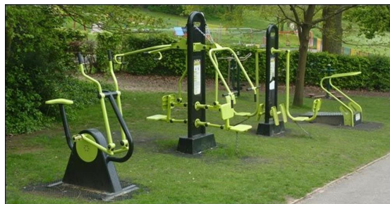
An example of an outdoor gym

*We would like to reassure those who asked why we are not considering using the funding for something else that this is not possible as it can only be used for the outdoor gym.