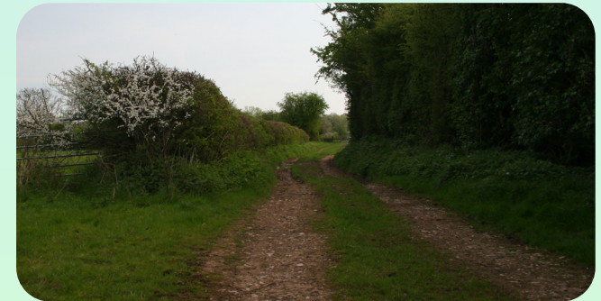
View along Cow Lane towards the stile

From the stile, continue straight ahead, keeping to the left of the next field, to join the usually muddy Cow Lane.