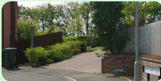
Nancy Talbot Close - leading to the footpath

Turn left and after 15m cross the road into Nancy Talbot Close (3) and walk straight ahead onto a footpath to the right hand side of house number 5. This leads via a stile onto the field at the rear of the houses.