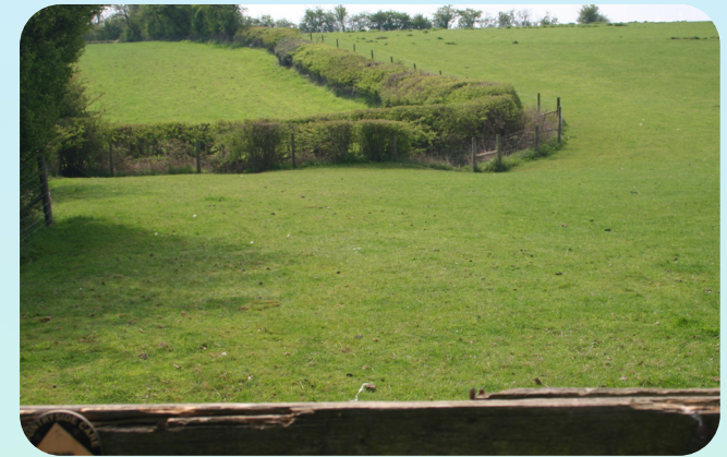
View at stile towards Cow Lane - hedgetops on the horizon

Cross the field diagonally left to the far corner through a wide gap. Follow the left hand side of the field, over stiles at either end of a bridge.