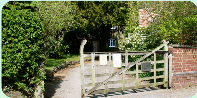
School House - formerly the Free Grammar School