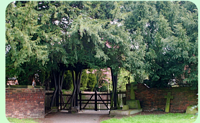
Lych gate leading back to the High Street and Market Place

Aiming for the church tower, cross the stile into the churchyard (13) and onto a tarmac path. Following the path with the vicarage hedge and wall close on your right, you will reach the lych-gate (14) which you pass through. After this take the first left turn to return to the Butter Cross.