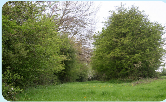
The inner hedge parallel to Seedcroft Lane

Turn right along the lane, cross the Lichfield Road with care and continue along Seedcroft Lane opposite. 75m after passing the end of Mill Lane, which is unnamed and the first lane on the right, go over the stile on the right (8) .