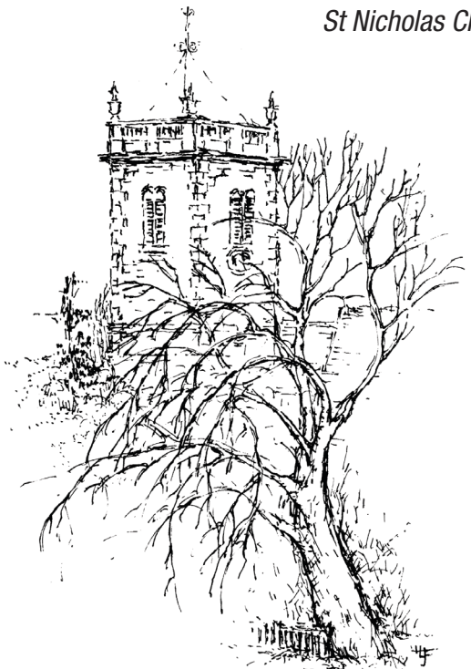
St Nicholas Church