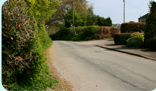
Radmore Lane - looking towards kissing gate

Go diagonally across the playing field to the far corner, keeping to the left of an old sports pavilion. If there is a games lesson or village cricket match in progress, go round the edge of the field to the right to join the path near three coniferous trees. Leaving the playing field, follow the path, which goes between the tennis courts.