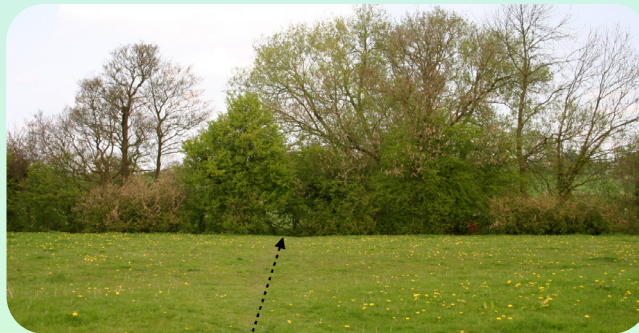
Gap through to stile and the bridge over brook

Walk diagonally across the field, keeping to the right of the pole and nearby pit, towards the large school building on the horizon just visible through the tree line.