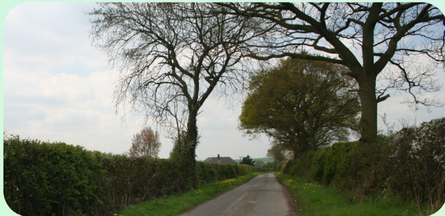
View along Broad Lane towards Lichfield Road

Continue until a sharp right hand turn leads to another stile and bridge which you cross (6) . Go diagonally left across this next field, keeping about 30m to the left of the pole in the opposite hedge, to reach a stile in the far corner onto Broad Lane (7) .