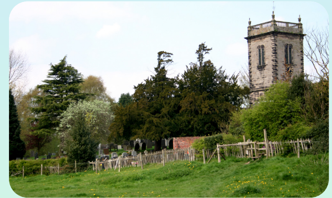
Approaching the churchyard from Hallhill Lane

Walk along the track until it reaches the junction with Hallhill Lane where you will see a stile opposite you (12) . Go over the stile into the field keeping to the left of the farm buildings.