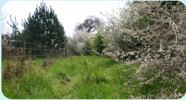
Path continues with hedge on the right and fence on left

Go over the stile and bridge then follow the path round to the left. Here the path continues with a hedge on the right and fencing to the left.