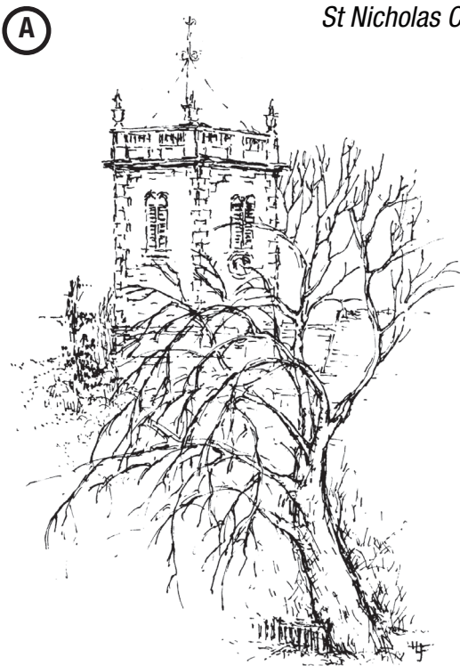
St Nicholas Church