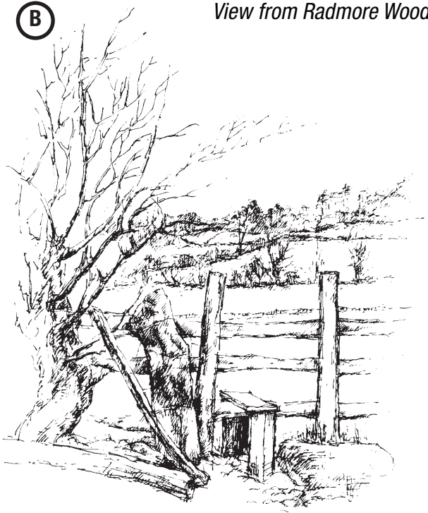
View from Radmore Wood