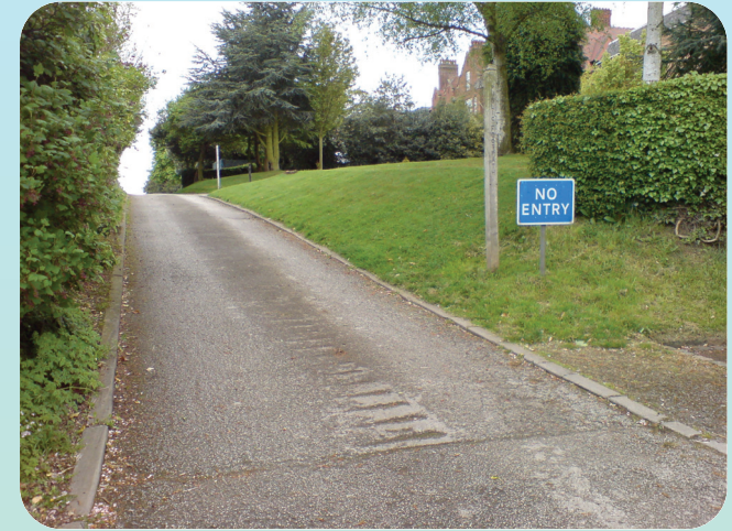
Take the school drive opposite the shop

Turn right at the Burton Road and walk to the junction with Lichfield Road.