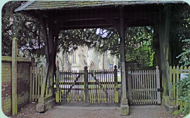
Enter the churchyard via the lych gate

Follow the path to the right of the church, noticing the Catholic Church on your right, and go round the end of the