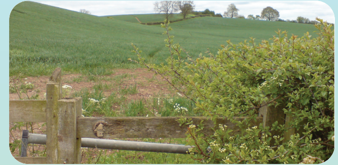
View across sloping field from stile by metal gate

(If it is very muddy you may prefer to miss out the sloping field after Dunstal Brook and continue for about 600m along Schoolhouse Lane to Radmore Wood Lane where you turn right and right again after 300m by the first barn to walk along the wide track to the stile by the metal gate.)