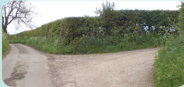
Turn right off Harley Lane onto a wide track

The lane originally led to the Harley Open Field which was enclosed before 1799. It was used as a wartime airfield, later became a storage depot and the buildings are now used as part of a poultry farm.