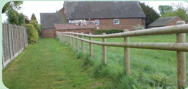
Path behind houses to Schoolhouse Lane

Just before the top of the hill turn right along a wide track (3) which runs behind the houses and walk to the end. Go through the kissing gate by the entrance to The Gables and, keeping to the right hand side of the fields, follow the path which will lead you behind the houses