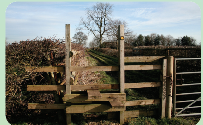
Stile where you turn back to return to village

Go over the stile by a metal gate a little beyond the brook (5) and keep below an isolated tree in the sloping field to find the stile in the hedge. (6) From here aim diagonally across the field, keeping to the right of a tree on the skyline, and make for the stile by a metal gate to the right of the field corner. (7) Continue across the next field towards the two barns to a stile beside another metal gate which is where you join the path to return to the village (8). In the spring you may like to walk the few yards along the wide track to view the display of daffodils in Radmore Wood Lane before turning back.