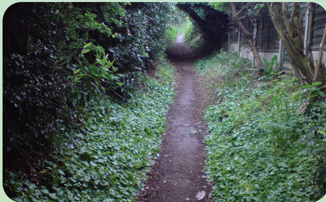
Narrow Lane looking towards Goose Lane

church and down the slope to the kissing gate at the far side of the churchyard and behind a bungalow (1).