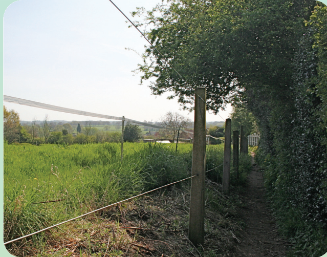
Follow the path to a kissing gate

Continue, slightly right, across the next field to Cowboy Bridge (11) , and then go diagonally left to a kissing gate in the field corner (12) . Follow the hedge to the left into Radmore Lane, go right and, immediately after the first house, turn left through a kissing gate (13) and follow the path to a kissing gate in the corner behind a bungalow (14) .