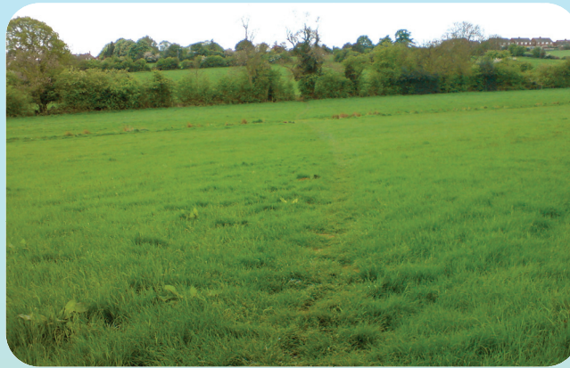
Slightly right to Cowboy Bridge

Continue, slightly right, across the next field to Cowboy Bridge (11) , and then go diagonally left to a kissing gate in the field corner (12) . Follow the hedge to the left into Radmore Lane, go right and, immediately after the first house, turn left through a kissing gate (13) and follow the path to a kissing gate in the corner behind a bungalow (14) .