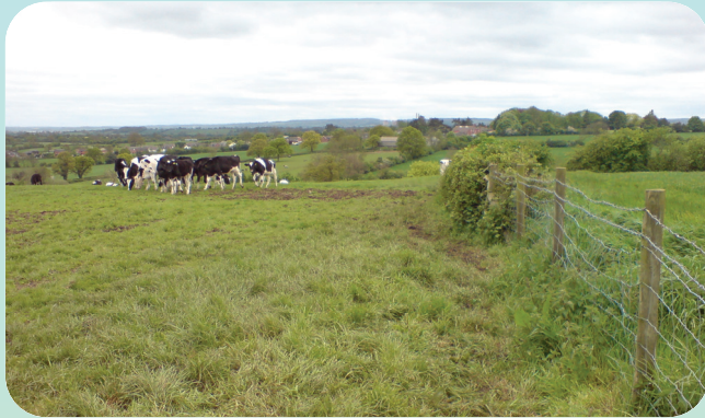
Follow the hedge on your right

From the stile at the end of the wide track you are now going to walk roughly south-west towards the village. Make for the stile 30m left of the one you previously came over (9) . Go over it and also the stile, immediately to the left, beside a water trough.