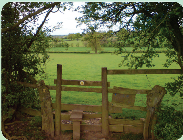
Stile at the bottom of the field (10) with the isolated tree that marks the next stile visible in the middle distance

Follow the hedge on your right down towards the village, crossing the stile at the bottom of the field (10) and a second stile by an isolated tree.