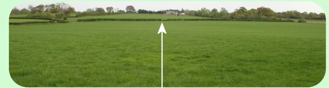
Stile in opposite hedge in line with house

Go over the stile and immediately turn half left and make for the opposite hedge to a stile (8) in the middle of the hedge and in line with the house with a chimney at each end of its roof.