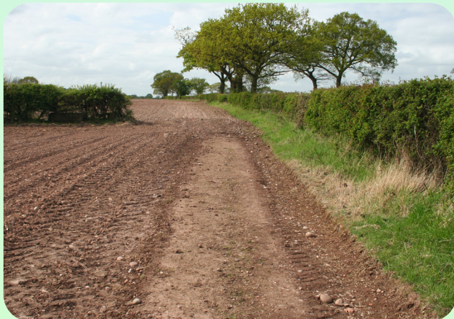
Follow the right hand hedge across three fields

Turn left along Pinfold Lane and, after a third of a mile, turn left through a gateway (10) immediately before Ashlands Farm and follow the right hand hedge.