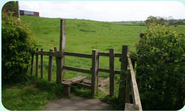
Stile tucked away in the churchyard behind the vicarage

Go immediately left following the path that runs parallel to the wall and hedge, to reach a stile tucked away in the churchyard behind the vicarage (1).