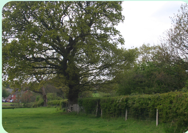
Stile just before a large tree

Go over this and follow the right hand hedge along to the stile just before a large tree which is very close to the Burton Road and near two garden sheds (13) .