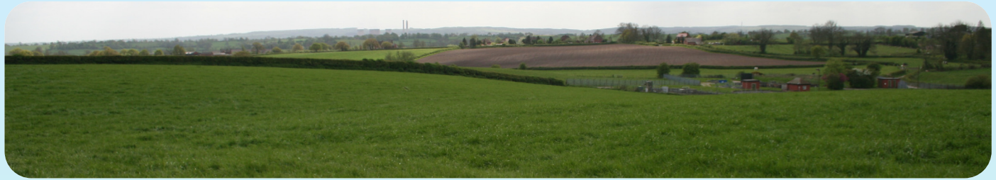
View across the Trent valley to Cannock Chase

another stile in front of the second of a pair of semi-detached houses (2).