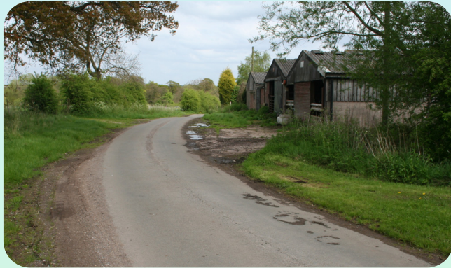
Left along Pinfold Lane

The site of The Pinfold is a short distance to the right and is now marked by a rough triangle where Broad Lane joins Pinfold Lane.