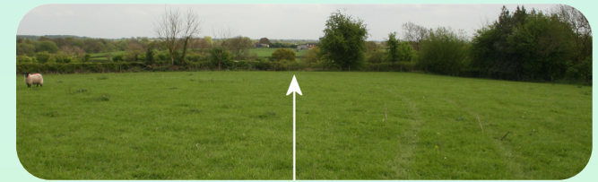
Towards the far right corner of the field

Cross the stile and walk towards a field reached by a second stile (4). Continue straight on, along the hedge, over a further stile (5) and immediately right to follow the hedge for about 100m (6). Now turn half left to walk roughly south-east to the far right hand corner of the