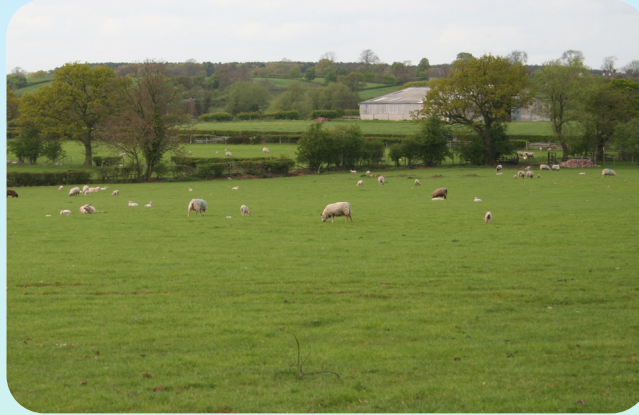
Diagonally across towards barn

Go over the stile in the corner of the third field (11) and walk diagonally across to the corner of the next field,