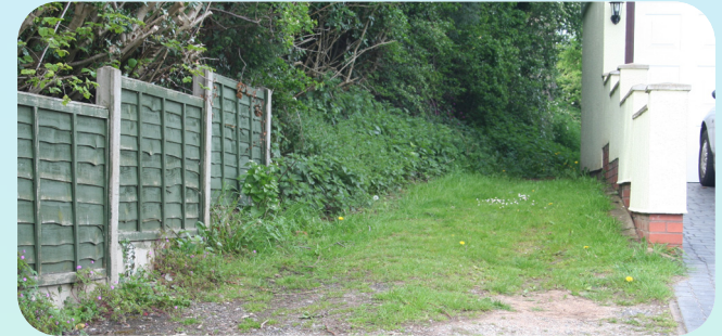
Path off Ashbrook Lane along left edge of bungalow

Walk left along the Burton Road, (Ashbrook Lane) towards the village, taking great care on the section with no pavement, and, 50m before the large road sign, take the path to the right along the left edge of the bungalow next to Ashbrook House (14) .