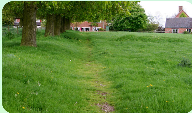
Follow the boundary round to a kissing gate

Walk 150m along the hedge on the right to a marker post and turn left for approximately 65m then right for a similar distance to a wicket gate. Passing through the gate, turn left and follow the boundary round to a kiss-