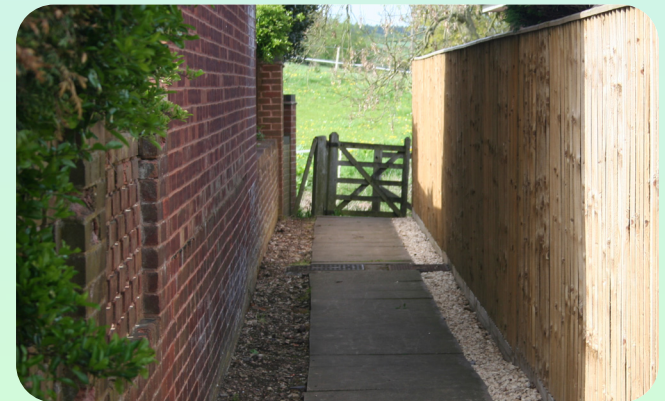
Footpath leading to Radmore Lane

Go up the steps, along the pavement, take the footpath on the right between the second bungalow and a house, (15) and then follow the left hand hedge beside the houses to Radmore Lane.