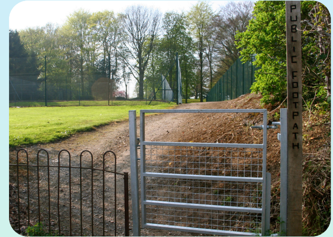
Kissing gate in Radmore Lane leading to playing field

Over a bridge and up the hill to where housing starts you will find a gate on your right between two tennis courts (15) .