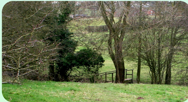
Wooden bridge across Ash Brook

Along here you will enjoy good views across the southern half of the village, Cannock Chase to the left and, on a clear day, Lichfield Cathedral. Continue to the bottom left corner of the field and over the stile. Follow this path round to the left and cross Ash Brook at the wooden bridge (13) .