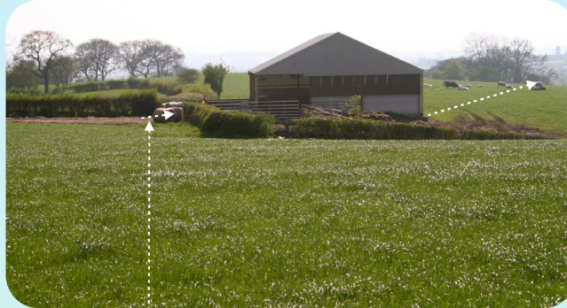
Cross in front of the stock shed and then bear left

When this hedge bears right (12) , turn left 90° towards a stock shed. Go through a metal gate in the hedge that encloses the area in front of the shed. Cross the front of the shed and head diagonally left across the field.