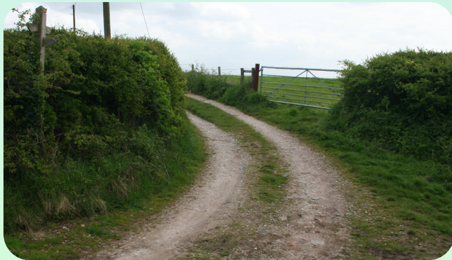
Straight on up a short track to a pair of houses

Go over the stile and left up the hill, keeping just to the right of the farm buildings. Just past the buildings, cross a stile in the hedge and straight on up the short track to another stile in front of the second of a pair of semi-detached houses (1) .