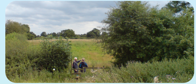
Crossing fields near Hart's Farm

Hart's Farm, on the south-east side of Pinfold Lane, is named after John Hart, who was the occupier in 1774, rather than after the male fallow deer. (See sketch on the map page)