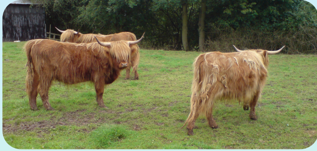
Highland cattle alongside Hoar Cross Road

About 100m past Barn Farm drive, go over the stile on the right (7) and follow the right-hand side of the first field. Go diagonally left across the second field aiming slightly right of the buildings on the skyline to a stile near the corner. Cross the stile and continue left across the corner of the field, over a stile and then half right to a stile in the middle of the hedge on the Burton Road. (8)