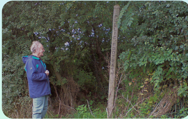
Stile hidden in the hedge on the right of Ashbrook Lane

left and down the tarmac drive to the Lichfield Road by the bus stop. Cross the road, turn right then follow the left hand side of Burton Road (Ashbrook Lane) on the pavement. Cross the road where the pavement ends and continue on the other side onto a grass verge in front of the houses. Continue in the same direction until about 100m after the bridge over the Ash Brook. Just as the road bends to the left, go to the stile hidden in the hedge on the right. (2)